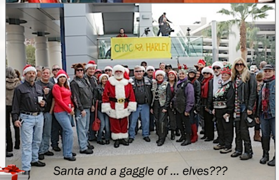
Santa and a gaggle of ... elves???