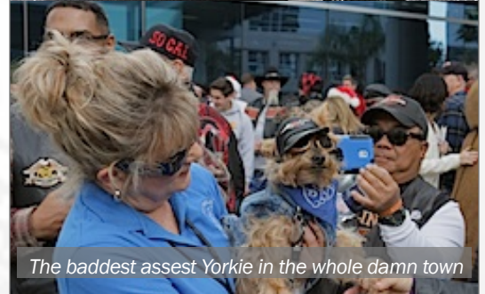
The baddest assest Yorkie in the whole damn town