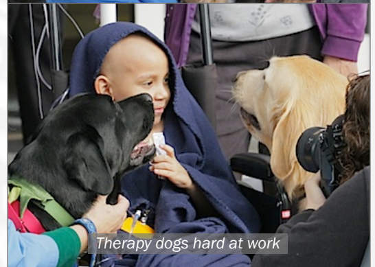
Therapy dogs hard at work