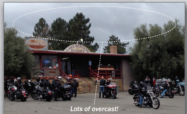
Lots of overcast!

After lunch, it was pretty uneventful on the way back. Our rides which take us anywhere in the vicinity of Julian [as today's did] guarantee a long post-lunch return route. That said, we made magnificent time on the I-15, 78, and I-5 which, gratefully, was devoid of any traffic stoppage. Those who finished at the dealership for the ritual cigars did so at about 3:00 p.m. ♣