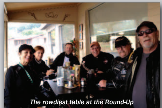
The rowdiest table at the Round-Up

Dangerous Road" when the weather is bad. As we approached the turn-off to South Grade, it was apparent it just wasn't going to be in the cards. The clouds hung way low, the road was wet, you knew it was going to be very wet on the way up, and there was a bit of drizzle on the visors even before heading up. If you're scoring at home, note: wet, low visibility, cold, steep, twisty, and precipitous drop-offs equals "stay off." So the call was made real-time to do just that, and we proceeded on to lunch at the Round-Up BBQ overlooking the lake.